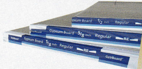
Image provided is for reference only, kindly obtain confirmation from Gyproc's Technical Support Personnel before submission of specification for any project.